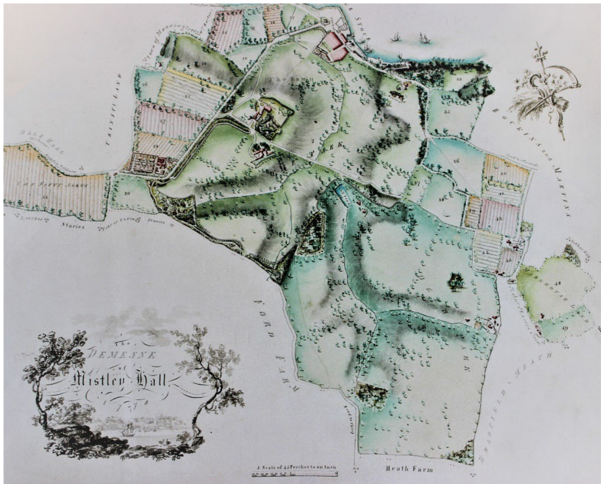
Figure 1 Survey of Mistley Hall 1778

During the public consultation, there was a query regarding the rationale behind the existing boundary of the Conservation Area in the southeast portion of Mistley Park, within the woodland plantation. Within this area, the delineation is difficult to discern on the ground. In response, Place Services conducted a review of the boundary, both on-site and through consultation of historic cartography.