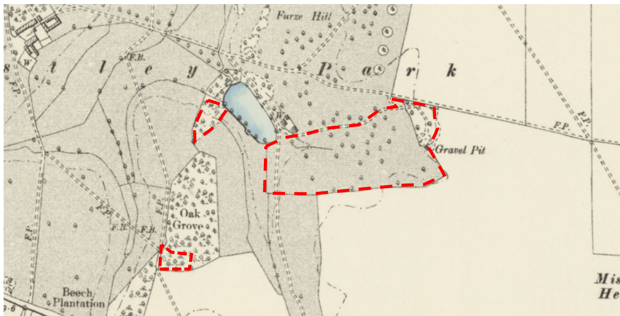
Figure 2 Excerpt of the 1905 Ordnance Survey Map of Mistley Hall, showing the proposed additions

The proposed boundary would follow the Ordnance Survey line as indicated below, resulting in a clearer and more robust delineation.